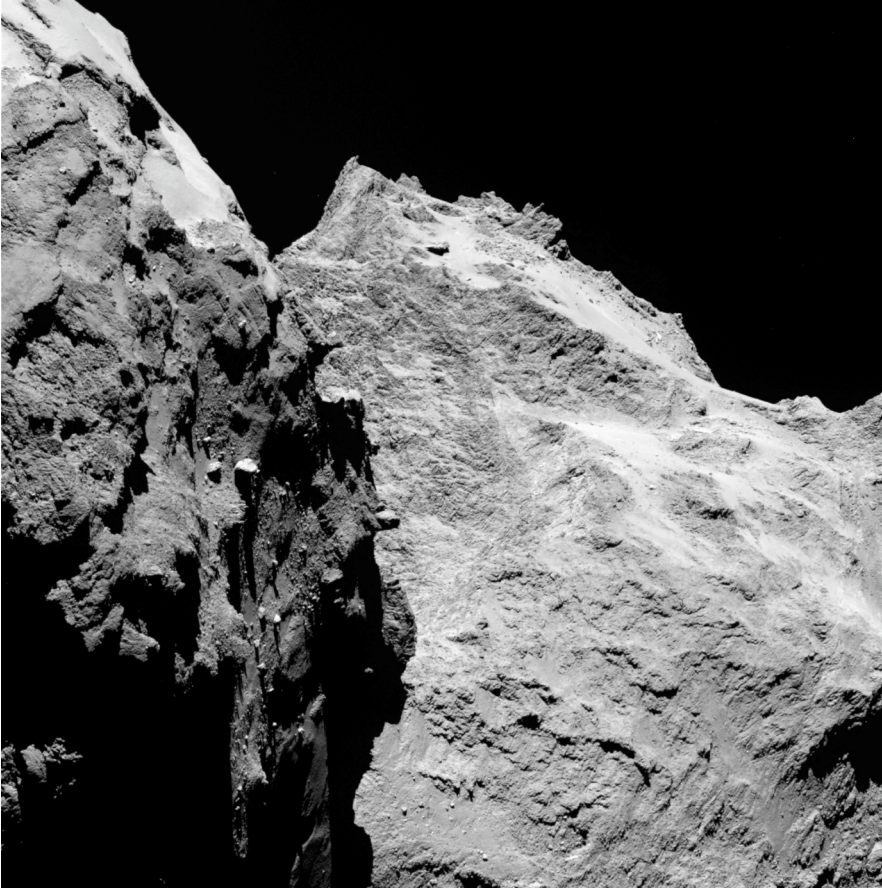
Figure 2: Jagged cliffs and prominent boulders: In this image, several of 67P's very different surface structures become visible. The left part of the images shows the side wing of the comet's "body", while the right is the back of its "head". The image was taken by OSIRIS, Rosetta's scientific imaging system, on September 5 th , 2014 from a distance of 62 kilometers. One pixel corresponds to 1.1 meters.